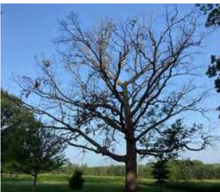
White oak, Friends Creek Campground

As a wildlife professional for a number of years, I have come to appreciate the enormity and the greatness of big oaks that can be found in the forests and savannas throughout Illinois. Many of these giants have been standing silently witnessing the changes in seasons, crop rotations, and man’s technology. Harvesting sunlight for energy their entire lives, the bigger and older oaks have consumed tons of carbon dioxide and drank pools of water while living as solar collectors on a grand landscape scale. This year the spring canopy of one such oak did not produce leaves the size of mice ears. The tree, a white oak ( Quercus alba ), likely grew for more than 150 years in Friends Creek Township, standing along Friends Creek Ditch, which feeds into Friends Creek. It kept its place just north of Duroc Road.