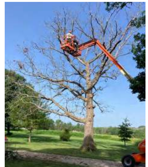
White oak being removed