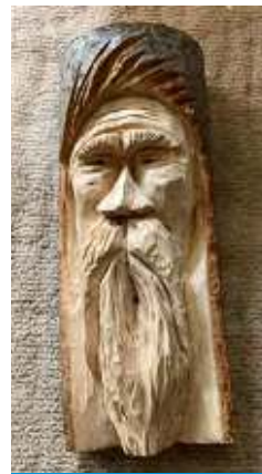
New life in the form of art: a woodcarving

serve as a resource for seasons to come. And I have looked at every big oak in this manner.